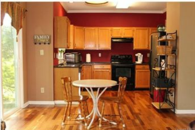
Move in ready home located in McDowell Farms! Close to I-77, I-85, I-485, Charlotte Douglas Airport and uptown!!! Inviting two story foyer leads you into the open concept, a kitchen which features beautiful granite