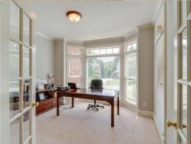
Immaculately maintained home with open floor plan that is bright and airy with a 2 story great room featuring built-ins and many windows. 5 bedrooms and 4 full baths with finished third floor bonus rooms.