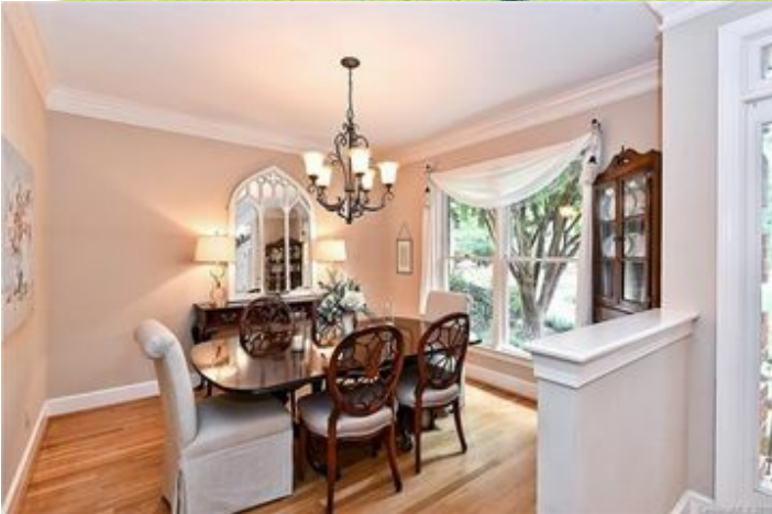
A unique opportunity to own a stunning brick home w/ a huge detached garage/workshop on over 5 acres not far from Mint Hill, Matthews, & 485! Perfect for reunions, gatherings or car enthusiasts! On a beautiful