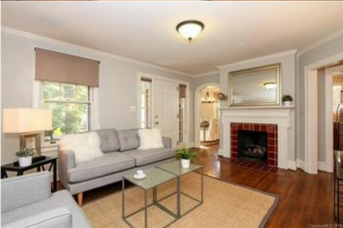
Historic Dilworth home built in 1929 on tree lined street with picture perfect curb appeal. Perched high above the main road and surrounded by mature trees this traditional brick home has an inviting covered