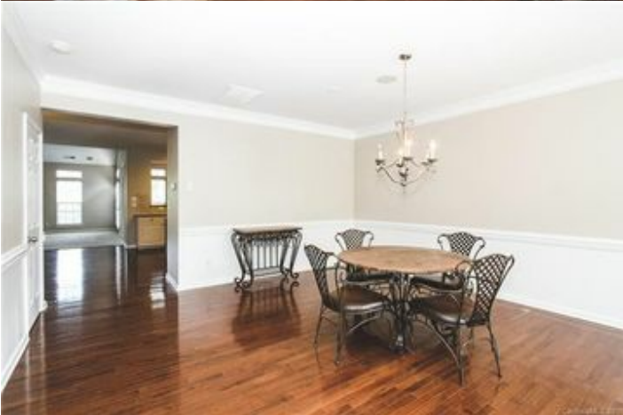
Beautiful townhome with full basement, great for entertaining. 3 bedrooms upstairs (including master bedroom and bathroom with garden tub) also a full bath. Granite kitchen counters, gas stove, refrigerator.