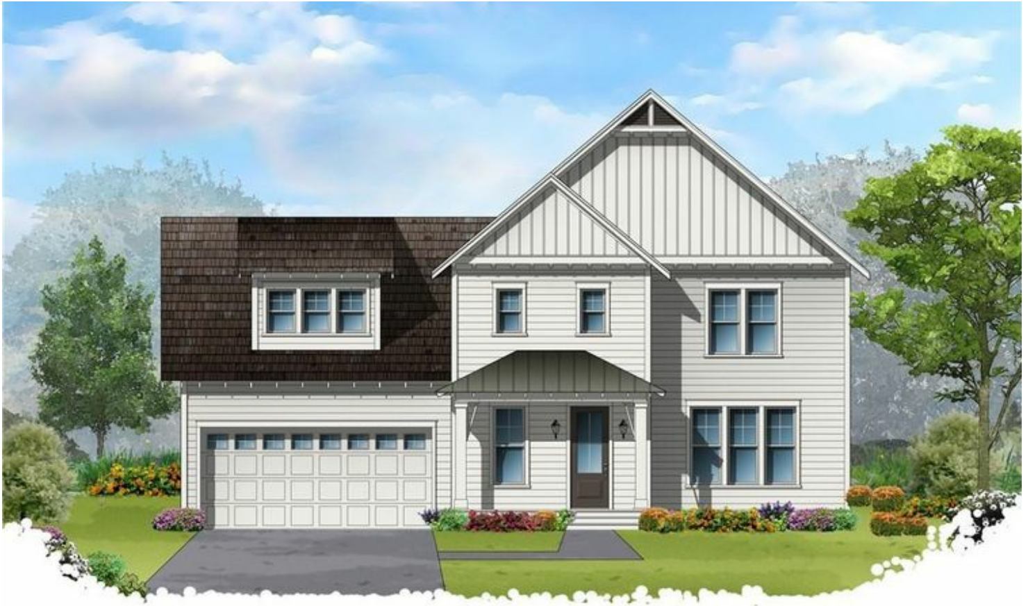
LANGTREE - LT 16

THE RESERVE AT LANGTREE PLANTATION MOORESVILLE, NC 28117