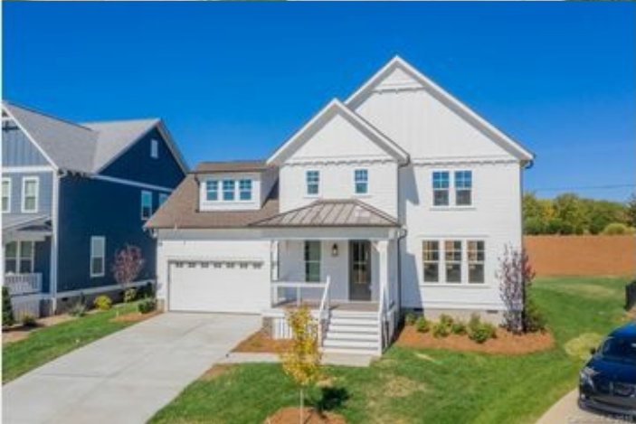
Luxury Craftsman Style Home